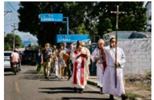
Palm Sunday procession to Lamb of God mission in Licay