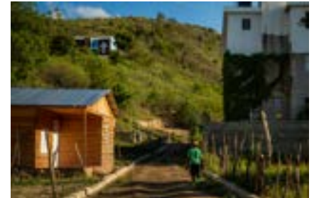
Seminary dormitory with cross on hill