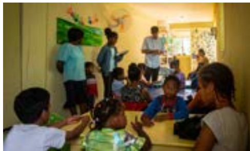
Sunday School in Las Americas