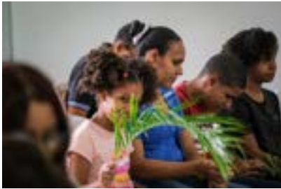
Palm Sunday at Pueblo Nuevo