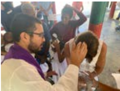
Baptism in San José de Ocoa mission start