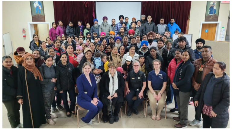
Community Open House at Ascension

Some who encounter the Church through our outreach efforts end up worshipping as part of the Lutheran Church—Canada's French congregation that meets in our building. Others, even if they have to leave the country, stay in touch and are connected with other Christian fellowships around the world when possible. We give thanks for the partnership of the Montreal Forum that allows Ascension to participate this way in the mission of Jesus Christ.