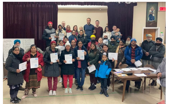
Graduates of a Beginners English class.